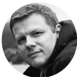
Ēriks Ešenvalds 拉脫維亞(Latvia)