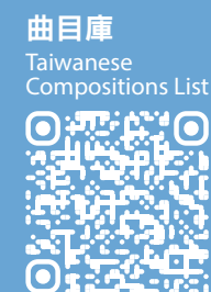
曲目庫 Taiwanese Compositions List

最少10位，最多60位（不包括指揮、伴奏） Minimum 10, Maximum 60. (conductor and accompanist excluded.)